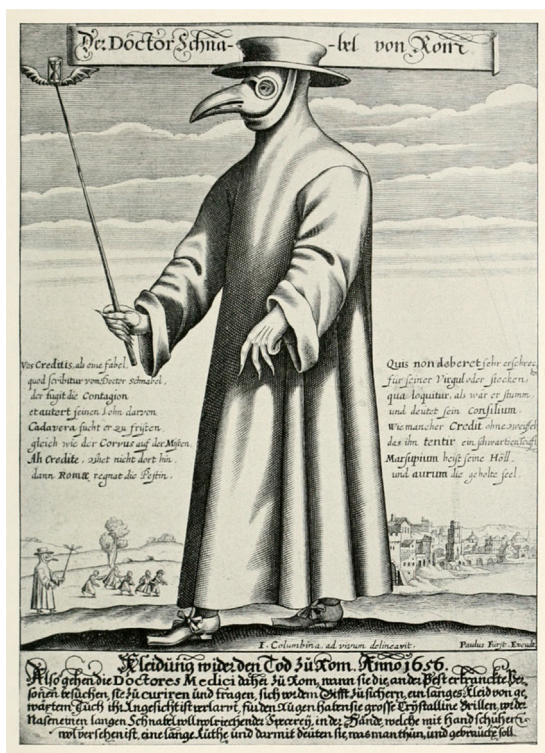
Figure 1 Paul Fürst, Der Doctor Schnabel von Rom. 1656. Copper engraving of "The Plague Doctor", in Rome.

the pulmonary capillaries, where it is phagocytized by monocytes, causing local inflammation and oxidative stress, due to the activity of IL6, IL8, TNF \infty and IF \gamma . These substances travel through the blood, activating acute phase reactants and platelets, creating hypercoagulable and vascular inflammatory response states, and increasing the risk of cardiovascular events 1,5,6 .